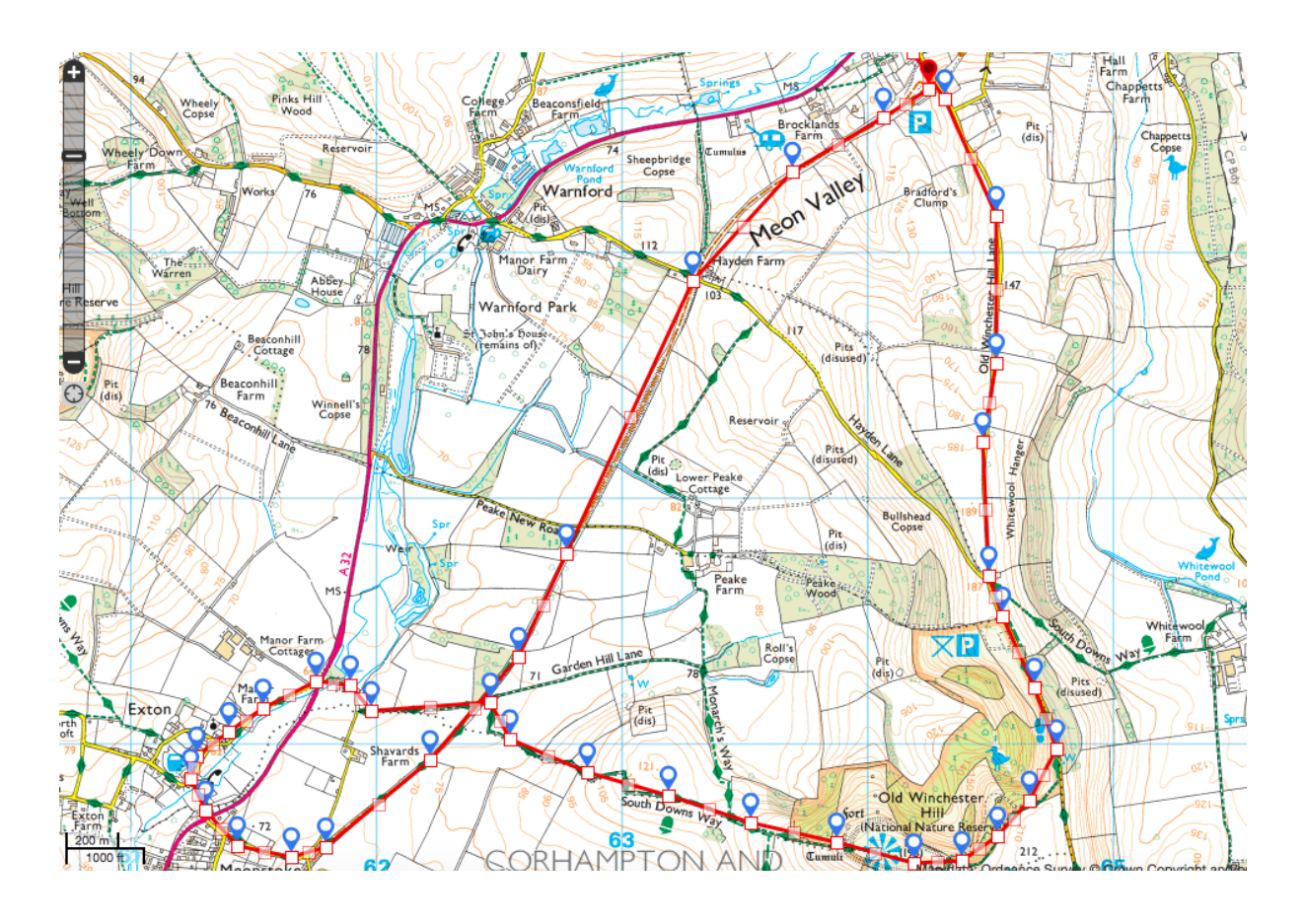
A seven mile walk up to Winchester Hill and along the Southdowns Way to Exton and The Shoe for lunch; back by the disused railway line.

Finally please do come again. The Meon valley is very special and we want to share our good fortune of living in it. Yes January and February can be a bit bleak but for the rest of the year we have the Downs, the beach hangers, the river, the chalk streams and the fields. We also have ready access to the wonders of Portsmouth Historic Dockyard, Uppark House (measure up the incredible restoration after the fire), gorgeous Alresford, Chichester Theatre (eat your heart out West End), Winchester Cathedral, Meon Springs Fly Fishing and on and on.