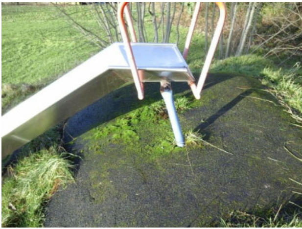
The slide start section incline is not in the direction of travel; it should slope towards the direction of the sliding surface Finding: