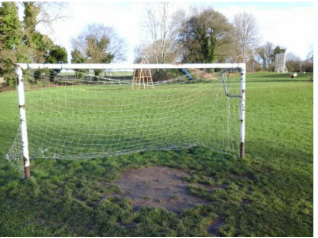
Finding: NB: We have undertaken a maintenance Action: inspection only of the football goal(s); full load testing fall outside the scope of our