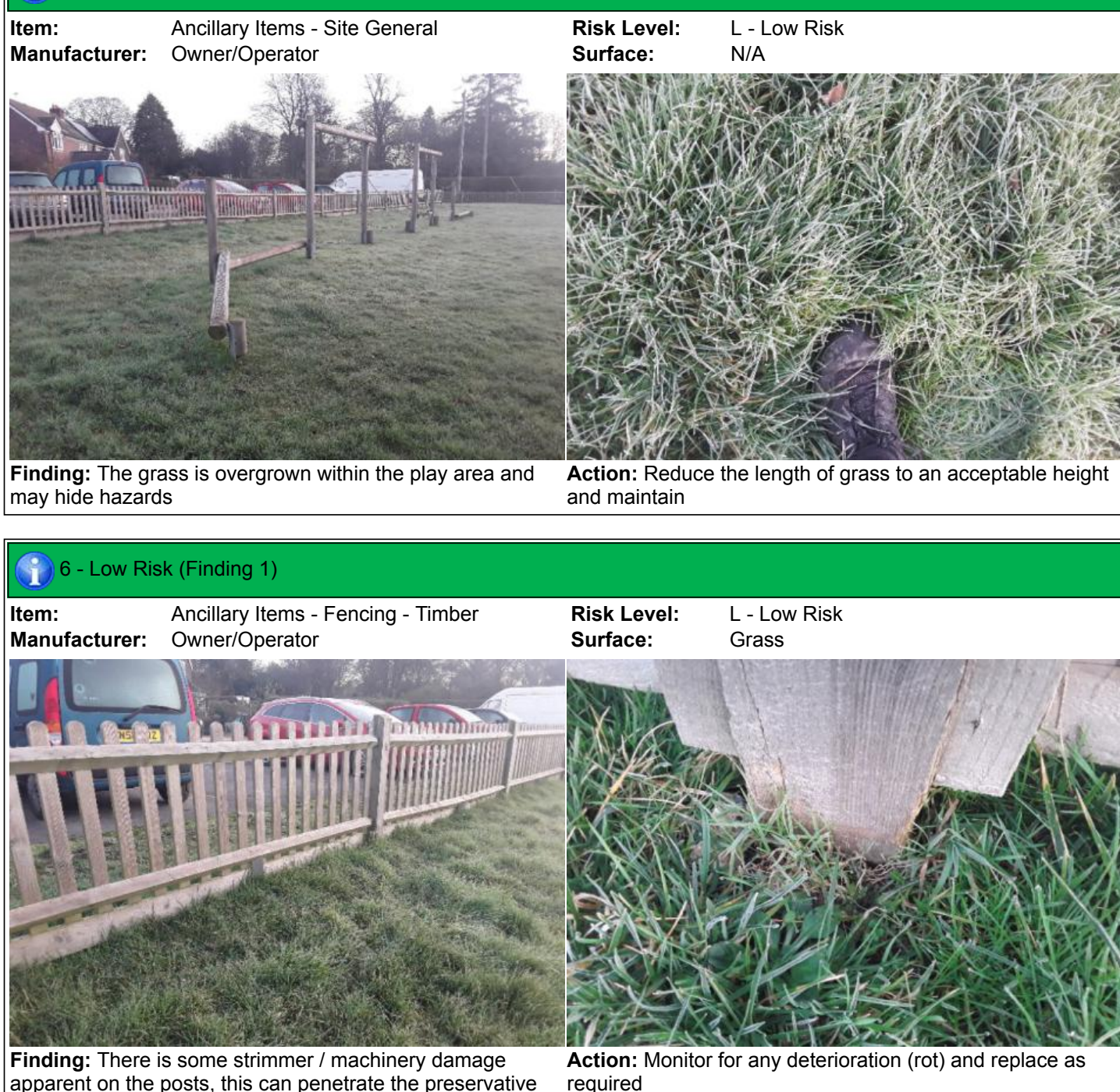
apparent on the posts, this can penetrate the preservative applied to the timber and accelerate the rotting process

The Play Inspection Company Ltd Unit 5 Glenmore Business Park Blackhill Road Poole Dorset BH16 6NL 01202 590675