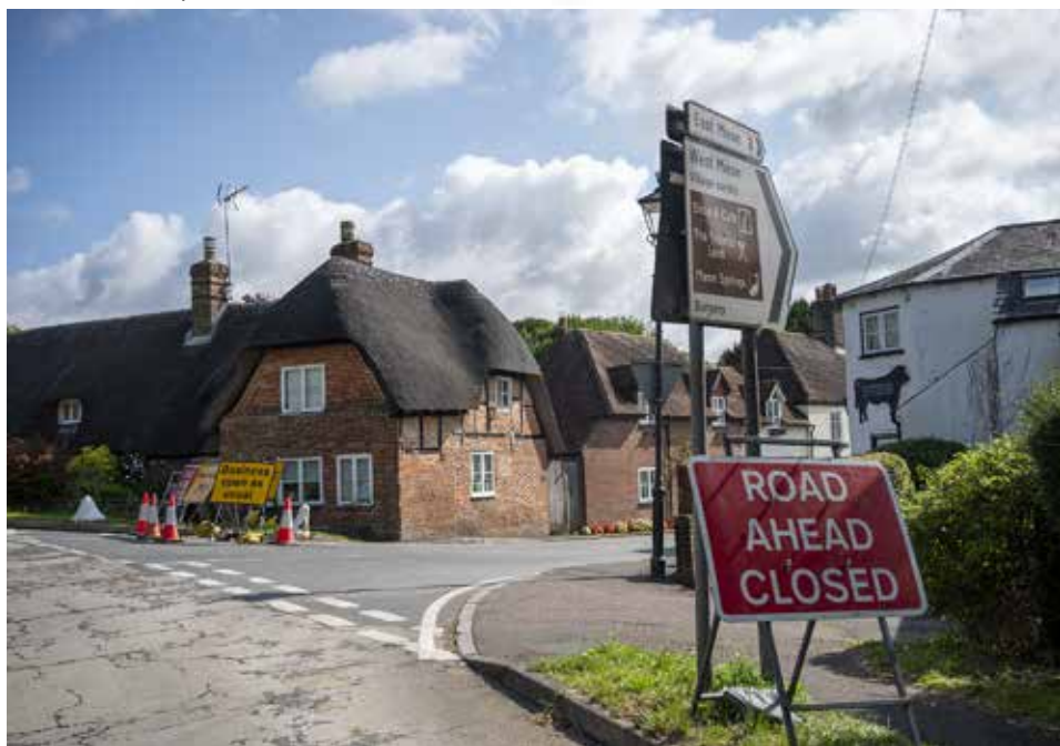
A32 West Meon High Street junction

In September, schools across the land respond to all the wonderful things that occurred over the summer, such as the exciting places visited and the great achievements of the students in sports, the arts and in public examinations and much more besides. They will also be working hard to welcome new staff, students and pupils, especially, making them feel valued in their new community.