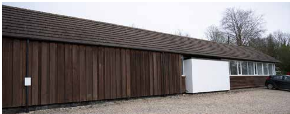
West Meon Village Hall: A Annabel

The West Meon Village Hall was officially opened in 1964 and this September we will be celebrating its 60 years with a 'Diamond Jamboree' of events for you to enjoy on Saturday 21st September. The day begins with a pop up café, featuring delicious coffee and cake prepared by the WI, who use the hall for their monthly meetings. We will hold a Flower Arrangement Competition - Garden flowers/Greenery arranged in a container of your choice. Please drop off entries to the hall between 10-11am. Judging at 11:15am.