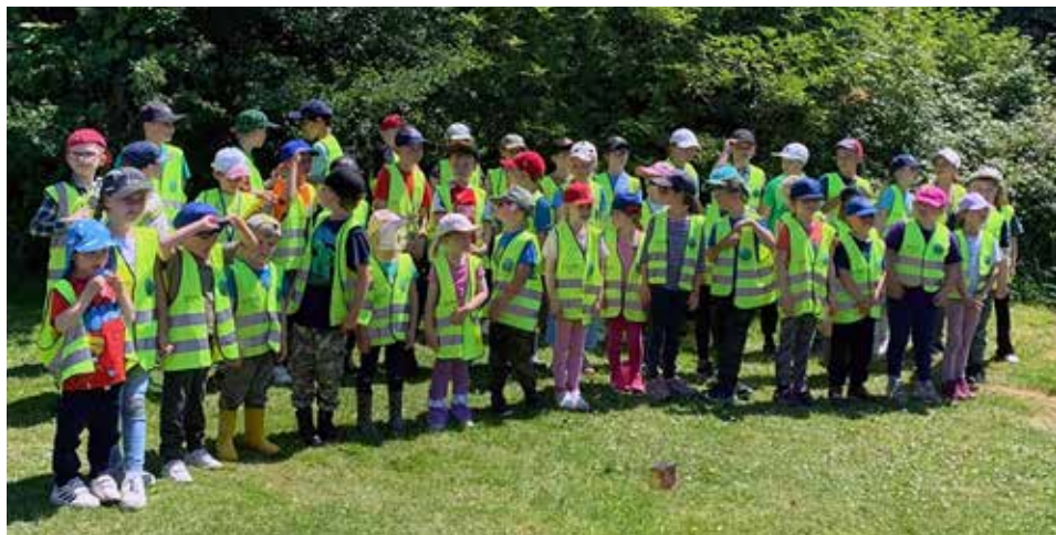
Stubbington activity day: from J Kelly

As well as Y5 having a fabulous and sun - drenched week at Stubbington Study Centre, the whole school went down for the day and had an amazing trip doing beach and pond studies. It is so lovely getting away as a whole school and the Pantomime in Winchester is already booked .