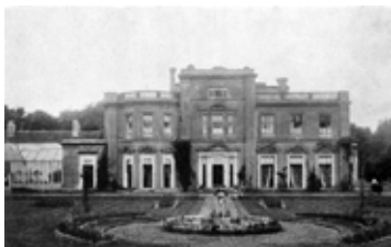
Warnford Park

If you missed it or just wish to revisit the day, head along to our website (Summer Show 2024) for a gallery of photos and lists of all the winners: https://edwin234.wixsite.com/wwwgardencountryside